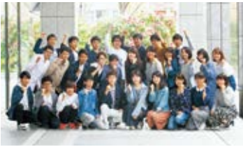
Group of new university students supported in the fiscal year ending March 31, 2019